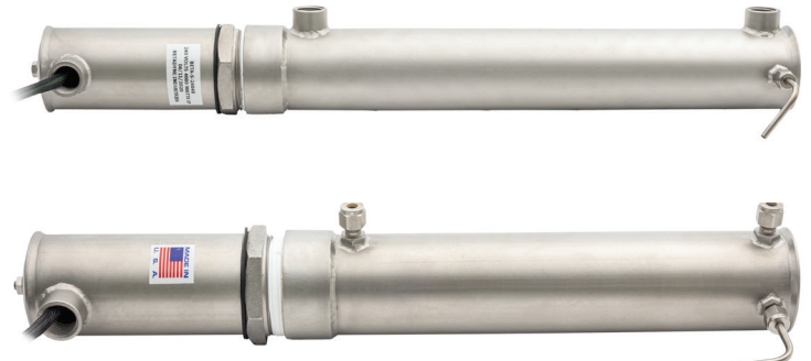
CRES-ILB Heaters – Threaded/Compression/VCR/etc.

With the CRES ULTRA line of heaters you will have vast heater surface areas for all power ratings, instant response. Further, CRES Heater's low watt densities avoid numerous inherent safety concerns and instant burn outs from High Watt Density Heaters, or exposed Filament Resistance wire heaters.